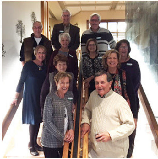
2019 HOA Board